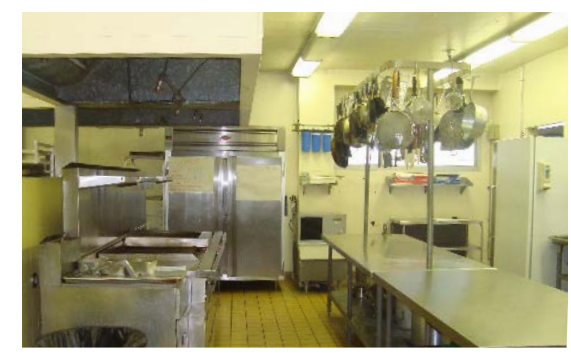
The central kitchen is undersized and needs major renovation.