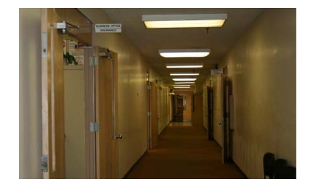
Upgrade interior finishes.