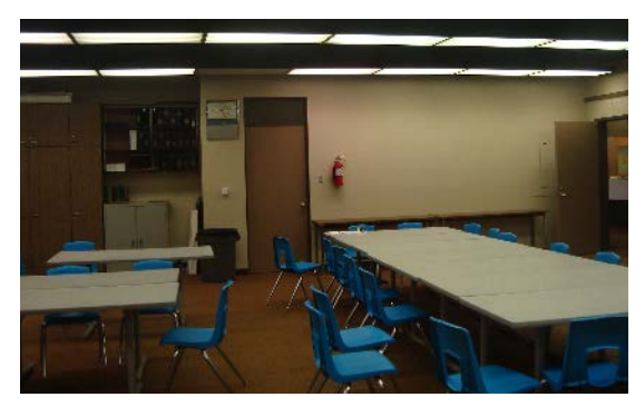
Need to improve lighting.