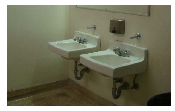
All restrooms need renovation.