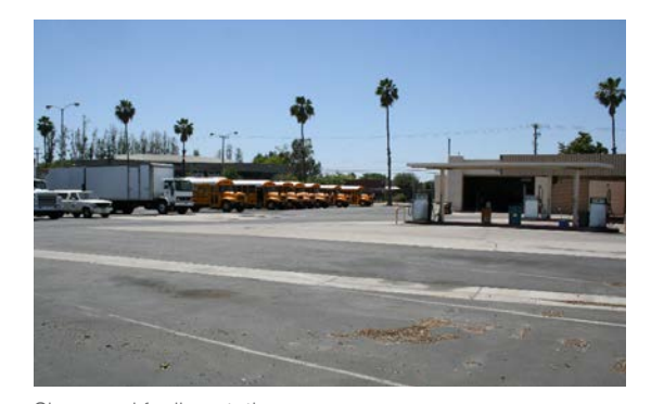
Slurry seal fueling station.